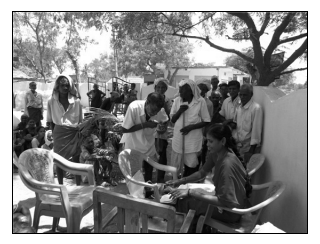
Figure 2: Payments Being Made to Pensioners by a Customer Service Point

The new approach in making payments represents a partnership between the Government of Andhra Pradesh and a nongovernment organization (NGO) called Zero Mass Foundation (ZMF), which credits the monthly payments of rural payees into their bank account and facilitates the withdrawal of funds from the account without requiring the payees to go to a bank branch or panchayat office.