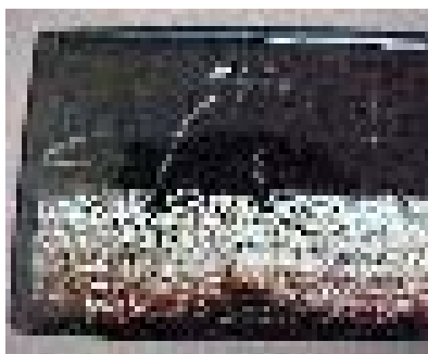
Figure 3. Drying of ginger

At present, the bulk of Nigerian ginger is marketed internationally in split-dried form, where the importing countries further process it into industrial products mainly ginger powder, essential oils, oleoresin and ginger ale concentrates. The amount of foreign exchange earned by exporting dry ginger is however very insignificant when compared with the amount spent on importing processed ginger products thereby substantiating the need for industrial processing of the Nigerian ginger within Nigeria (Meadows, 1988).