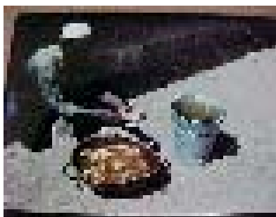
Figure 2. Splitting or peeling of ginger

Primary processing of freshly harvested ginger entails sorting, washing, soaking, splitting or peeling (Fig. 2) and drying (Fig. 3) it to a moisture content of 7-12% (Ebewele and Jimoh, 1981). The processing of the Nigerian ginger has not been standardized with the result that microbiological, organoleptic and chemical properties of the products often fall short of importers' specifications. Consequently, Nigerian ginger receives low rating in international markets and hence loss in foreign exchange earnings. The traditional drying methods used by farmers to dry ginger are varied, haphazard and risky, resulting in mould growth, loss of some volatile oil by evaporation and destruction of some heat-sensitive pungent properties (Ebewele and Jimoh, 1981).