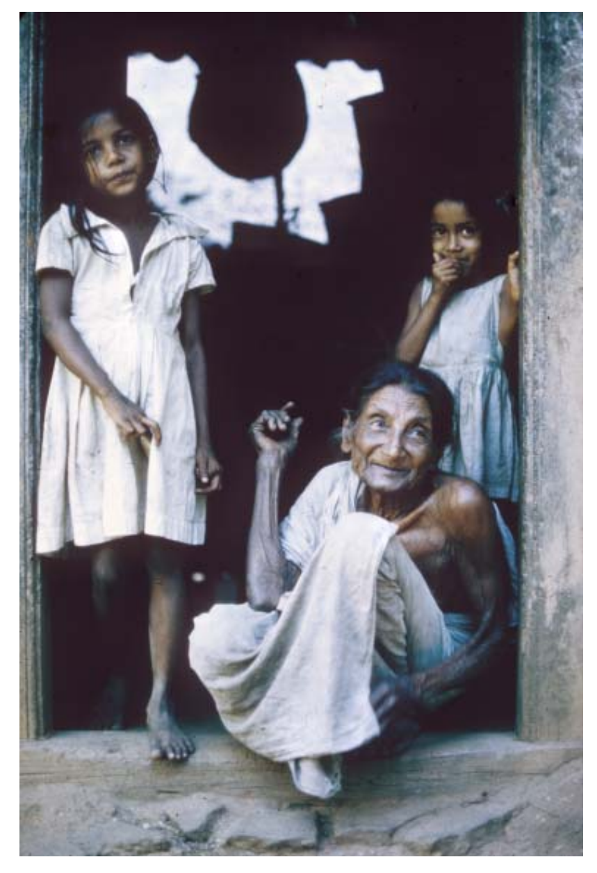
Figure 43. Householders at entrance to courtyard, Rangama Sri Lanka.