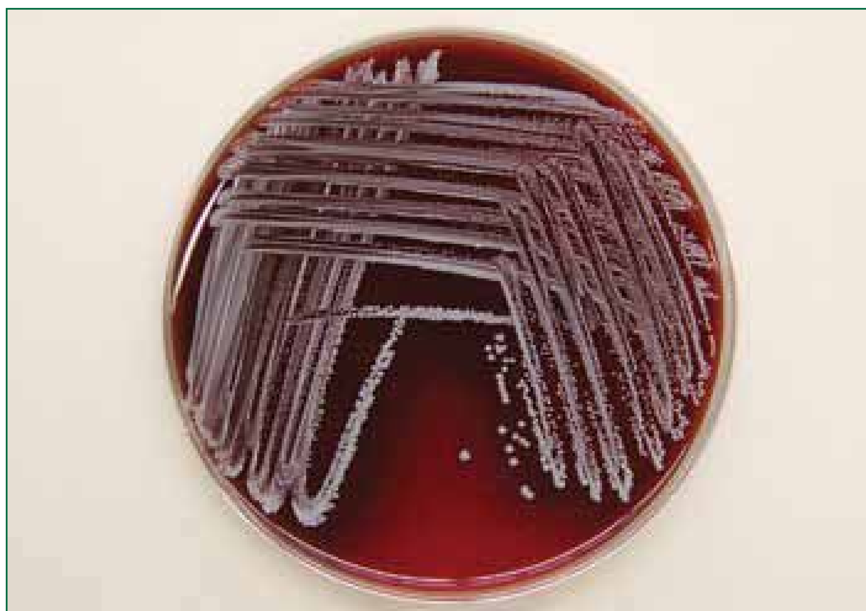
Coagulase-negative staphylococci on a blood agar plate.

different niches such as teat liners, hands of the milkers, the stall environment and teat apices are described, in search of sources and vectors for the species that frequently cause udder infections. Based on their epidemiology, the different CNS species can roughly be classified in three categories.