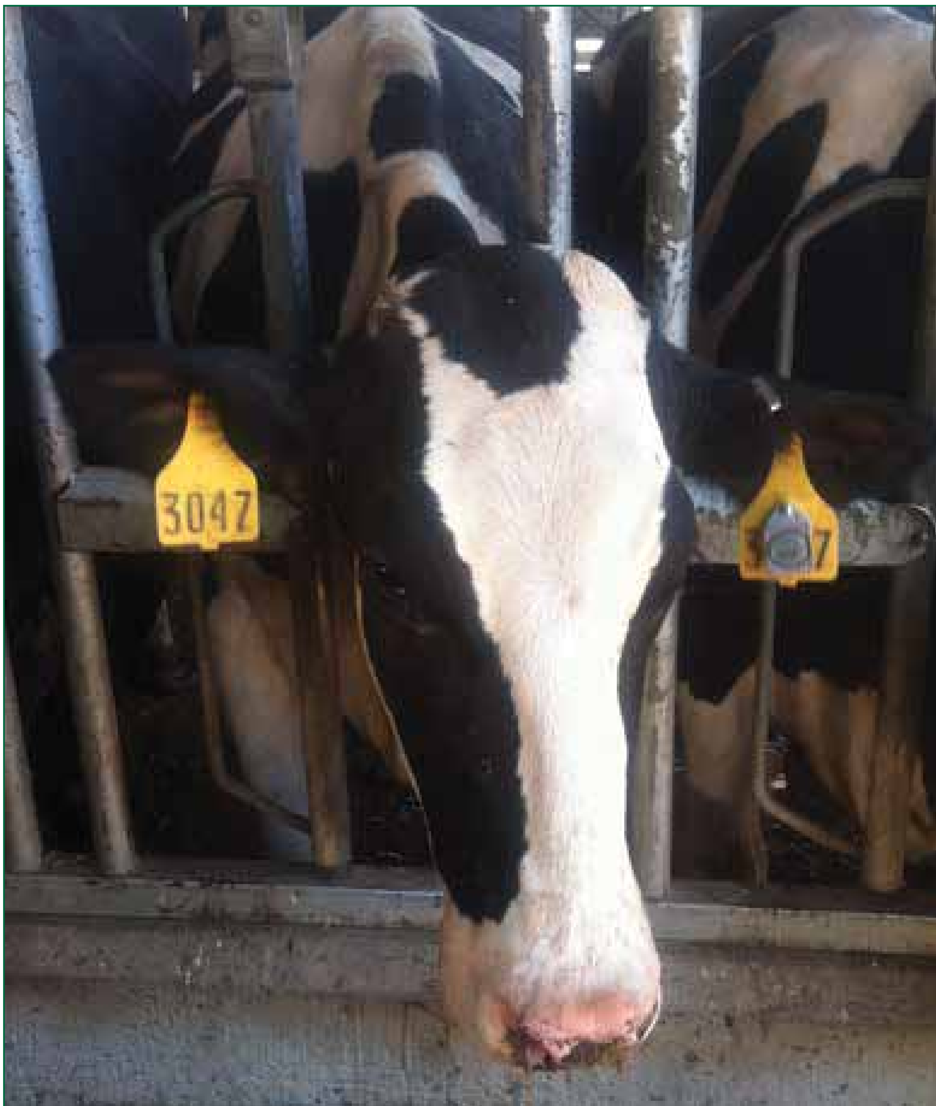
Figure 1. A cow with a calibrated light and activity monitor (Dimesimeter; Figuero et al., 2012) attached to her right ear tag. The dimesimeter can measure light levels for a cow at eye level.

Common light fixtures found on dairy operations are T8 fluorescent, metal halide, high pressure sodium, and, more recently, light emitting diode (LED). Each fixture has a unique set of benefits and drawbacks. For instance, fluorescent lights are energy efficient and can provide adequate light output. They are also relatively inexpensive and usually pay for themselves within two years of installation. On the other hand, fluorescent fixtures require maintenance, perform poorly under cold or hot conditions, and contain mercury which could be disastrous should a bulb break around lactating cows. High intensity discharge (HID) fixtures, such as metal halides and high pressure sodium fixtures can provide ample light at ground level when ceiling