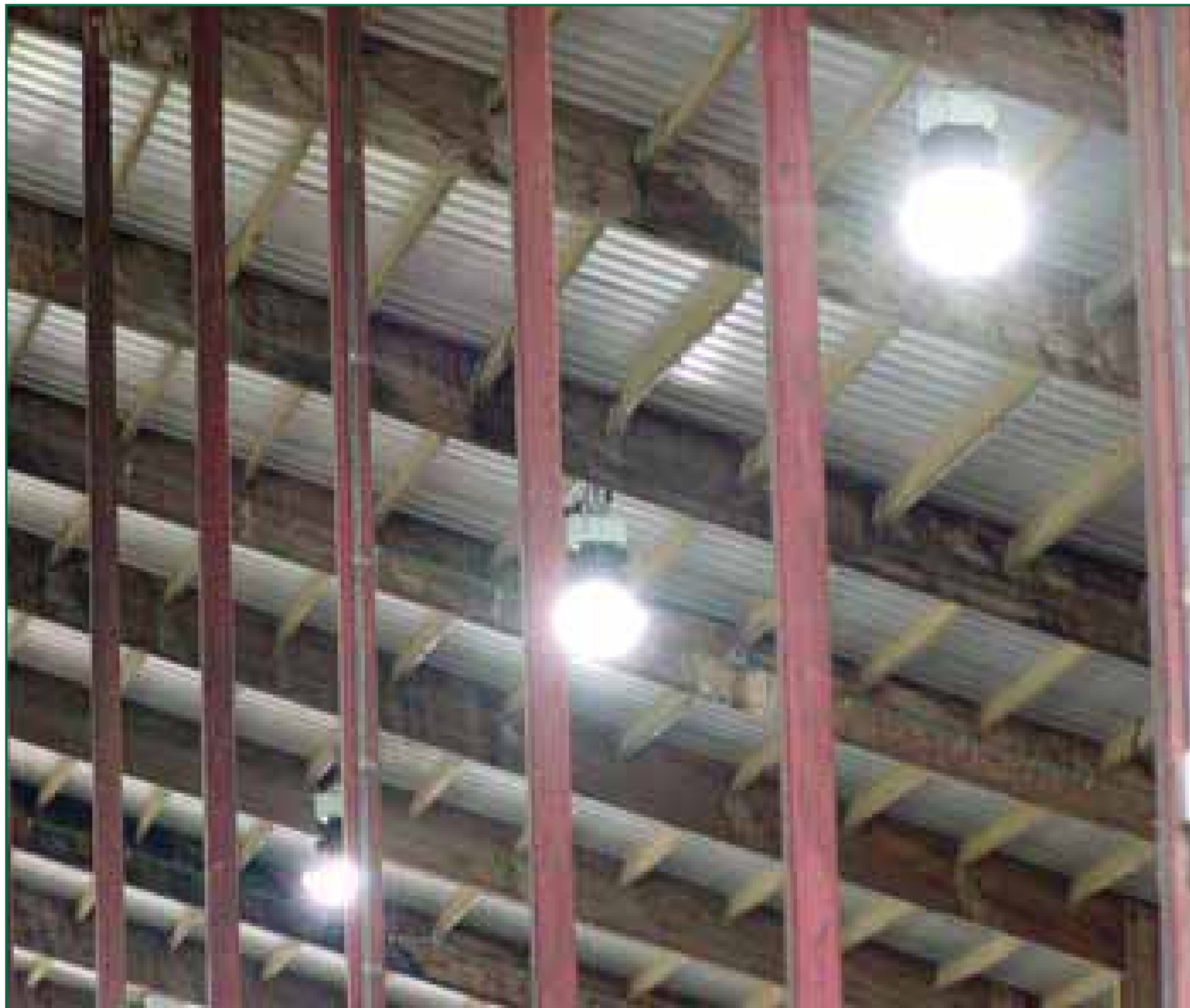
Figure 2. A 220W LED Luminaire installed in Barn "A". Thirty-two luminaires were installed in Barn "A" to meet the required light levels to expected to stimulate milk production according to 2012 research on photoperiod performance by Geoffrey Dahl.

heights are greater than 12 feet. However, these fixtures require a long pre-heat or start-up time. Finally, LED lights can provide high energy efficiency with a reported 100,000 hour operating life. This is significantly longer than the reported 20,000 hour operating life of fluorescent and HID fixtures. Moreover, LED lights are expected to have lower maintenance costs, contain no mercury, and provide instantaneous reliable light. However, LED fixtures are expensive compared to the other fixtures.