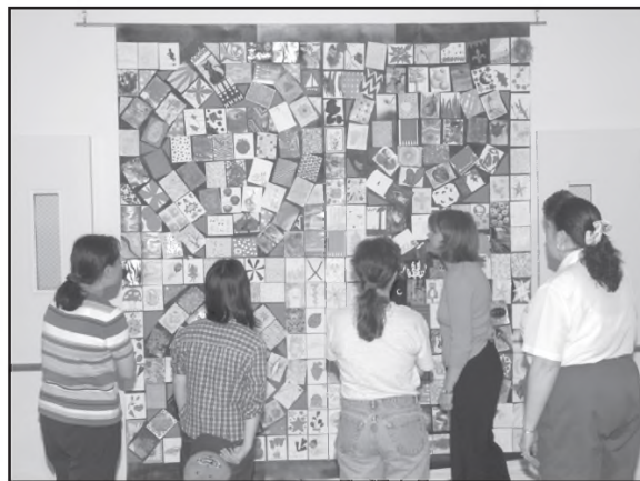
A 'community fashioned' mosaic was a popular feature at this year's art show

people who may not consider themselves artistic make a small piece of art and contribute it to the show. The mosaic idea also lent itself easily to incorporating elements of what we do at the Station. It was divided into quarters, with each quadrant featuring a picture made from the 'tiles' people turned in. The pictures were of an apple, a wine glass, leaf and ladybug. The finished project ended up as a visual representation of how the Station works with the effort of so many individuals going into the finished piece.