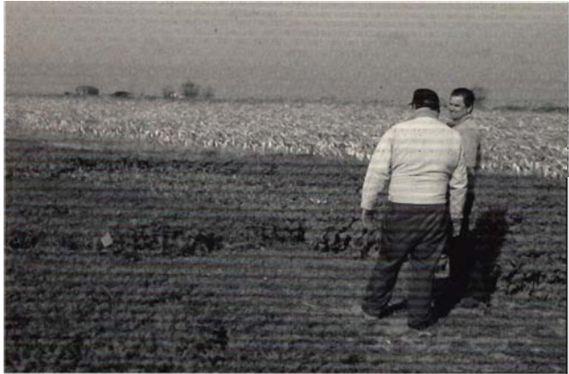
Cool-season brassicas grow rapidly during the fall following early-harvested vegetables. Brassicas are excellent nitrogen scavengers and may be used to suppress weeds and soil-borne pathogens.

Some cover crops pose specific management challenges, and others can have detrimental effects. For example, grain rye left to grow into late spring or sudangrass that is left unmowed in the summer can grow so vigorously that they are difficult to incorporate into the soil and can cause nitrogen immobilization. Direct seeding large-seeded vegetable crops into soil with fresh organic residues invites seed maggot damage. Some cover crops, such as hairy vetch, are hosts for common nematodes or soil-borne diseases such as white mold.