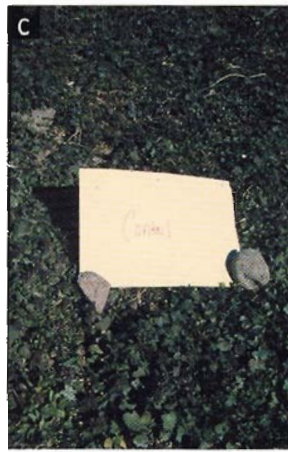
Non-winter-hardy cover crops can be grown in the fall and left to form a dead mulch the following spring. Oilseed radish (a) suppresses winter weeds very well compared to the control (c; no fall cover crops) but leaves little residue by April. Oats (b) are less effective at weed suppression but leave much more aboveground residue.

Japanese millet appears to be a good choice for weed suppression in any six-week opening in the summer. For warm, dry soils and longer weed control, sudangrass may be a better choice. For shorter openings, buckwheat works well. In trials in Massachusetts, two plantings of buckwheat (sown in early June and late July at 84 kg/ha) followed by winter rye (sown at 126 kg/ha in September) were extremely effective at reducing weeds for a subsequent lettuce crop. Such a system has the advantage of combining tillage with continuous cover crop competition for weed control.