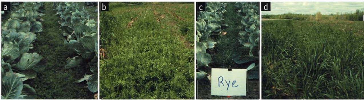
Interseeding storage cabbage with hairy vetch (a) or rye (c) enables a cover crop to be established long before the late fall harvest of the cabbage. The following spring, the strips of both vetch (b) and rye (d) have produced significant biomass, protecting the soil from erosion and adding organic matter. If well established, these cover crops can stand up well to traffic from the cabbage harvest except when fields are very wet.

clover is very low growing. Red clover can be frost seeded into wheat in late winter and can contribute up to 40 pounds of nitrogen per acre after one year's growth. The ability of most clovers to tolerate shade makes them useful for overseeding. Red clover taproots may also be beneficial in breaking up compacted soils. Dutch white clover can be useful for walkways or alleys. Crimson clover, although not winter-hardy, can be used as a summer nitrogen-fixing cover crop.