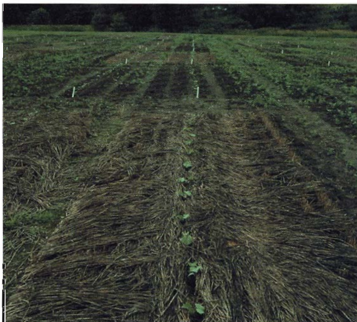
Pumpkins can be no-till planted into an herbicide-killed rye cover crop for annual weed suppression. The rye mulch can facilitate walking in pick-your-own pumpkin fields and minimizes dirt and mud on the pumpkins. This system requires careful planting and is not appropriate in fields that have perennial weed infestations.

Japanese millet appears to be a good choice for weed suppression in any six-week opening in the summer. For warm, dry soils and longer weed control, sudangrass may be a better choice. For shorter openings, buckwheat works well. In trials in Massachusetts, two plantings of buckwheat (sown in early June and late July at 84 kg/ha) followed by winter rye (sown at 126 kg/ha in September) were extremely effective at reducing weeds for a subsequent lettuce crop. Such a system has the advantage of combining tillage with continuous cover crop competition for weed control.