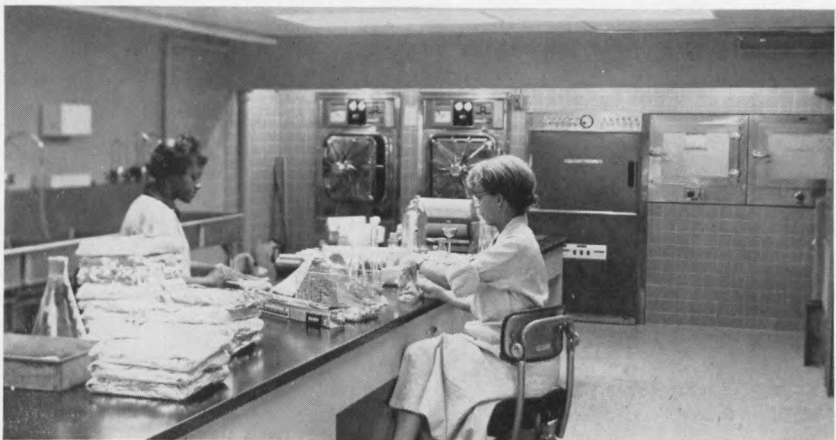
Histological and laboratory assistants in their new glass preparation quarters.