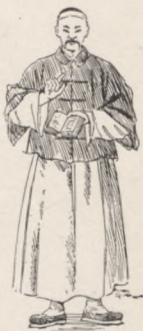
THE CHINESE PREACHER

In round numbers, ten thousand native preachers of the gospel, working at five thousand different points throughout the land; two hundred thousand Chinese Christians, and probably half a