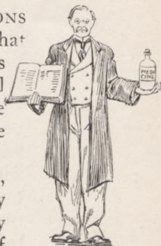
A MISSIONARY WITH SCHOOL BOOK IN ONE HAND AND MEDICINE BOTTLE IN THE OTHER

Chinese doctors there are galore, wearing their glasses and looking very wise; but they are quacks of the very worst kind, having no knowledge of the first principles of anatomy or physiology; using the most absurd sort of medicines; mixing a dozen