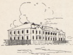
THE PRESBYTERIAN MIS- SION PRESS

to its present high state of perfection by the great printing establishment of the Presbyterian Board in Shanghai.