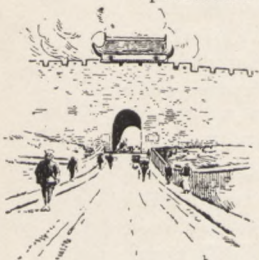
GATEWAY AND WALL

A striking feature of China are its walled cities, which surround the capitals of every province, prefecture and district. These walls are from twenty to thirty-five feet high, surmounted by parapets and entered by large arched gateways. The number and size of these cities are so many and great that it might be inferred they contain a large proportion of the country's inhabitants. Not so. Innumerable villages of all sizes dot the fertile plains, and China's village life embraces two-thirds of the popu-