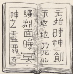
THE CHINESE BIBLE

It stands out as most conspicuously true that Protestant missions in China have been the great pioneers of modern education there. They are only a century old, and yet in the face of gigantic difficulties, wonderful things have been accomplished. Dr. Robert Morrison led the van of modern missionaries to China in 1807. Overcoming tremendous