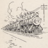
A TRAIN OF CARS

It is not claimed by any means that missions stand alone as the uplifting power which has been at work in China. War and diplomacy, though they have been guilty of many great wrongs, have yet been mighty forces for breaking down barriers, establishing treaties, and opening intercourse with the outside world. Mercantile pursuits, commerce, trade, manufacturing interests, have set wheels of progress in motion which know no backward turning. Railroads, four thousand miles of them, are running from city to city and province to province with their locomotives screaming in unmistakable notes, "A New China." Maritime customs which are honestly administered, have been of immense service. Individuals here and there have not been wanting