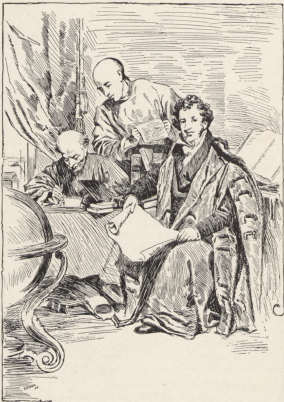
DR. ROBT. MORRISON ENGAGED IN TRANSLATING THE BIBLE