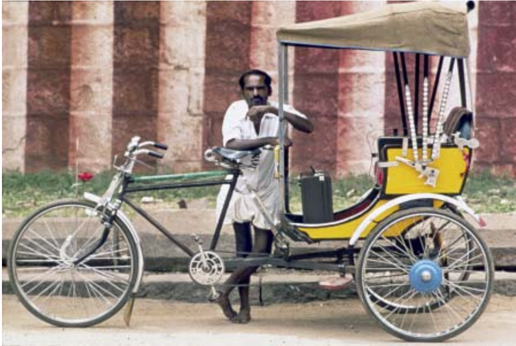
Figure 45. Rickshaw driver in front of exterior wall around precincts of Meenakshi Temple, Madurai, Tamil Nadu, India.